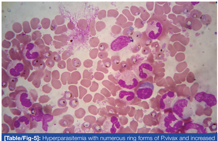
number of neutrophils with a single atypical lymphocyte. Neutrophilia in malaria is an indication of poorer prognosis. Original magnification 400x. Giemsa.

[Table/Fig-4]: Bonferroni test for comparison between individual group HS – highly significant, sig- Significant, NS- Not significant